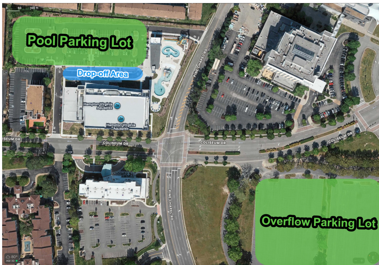
Figure 1: HVA parking map showing pool parking lot, drop-off area, and overflow parking at the Coliseum

Parking will be a challenge — please carpool with your team whenever possible.